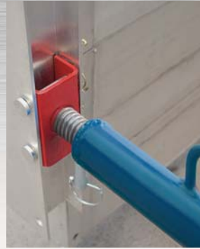
Adjustable NiCad plated screw jacks